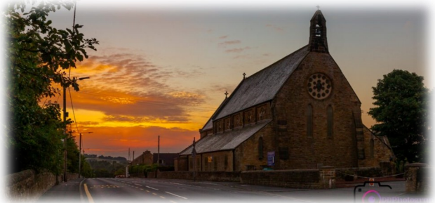
St Ives Church, Leadgate