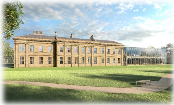
The Story at Mount Oswald

Published 16 February 2024 by Durham County Council