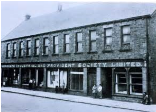
Leadgate Co-operative Store

1868, one of three children. He was baptised at Shotley Bridge Primitive Methodist Church on 21 February 1869.